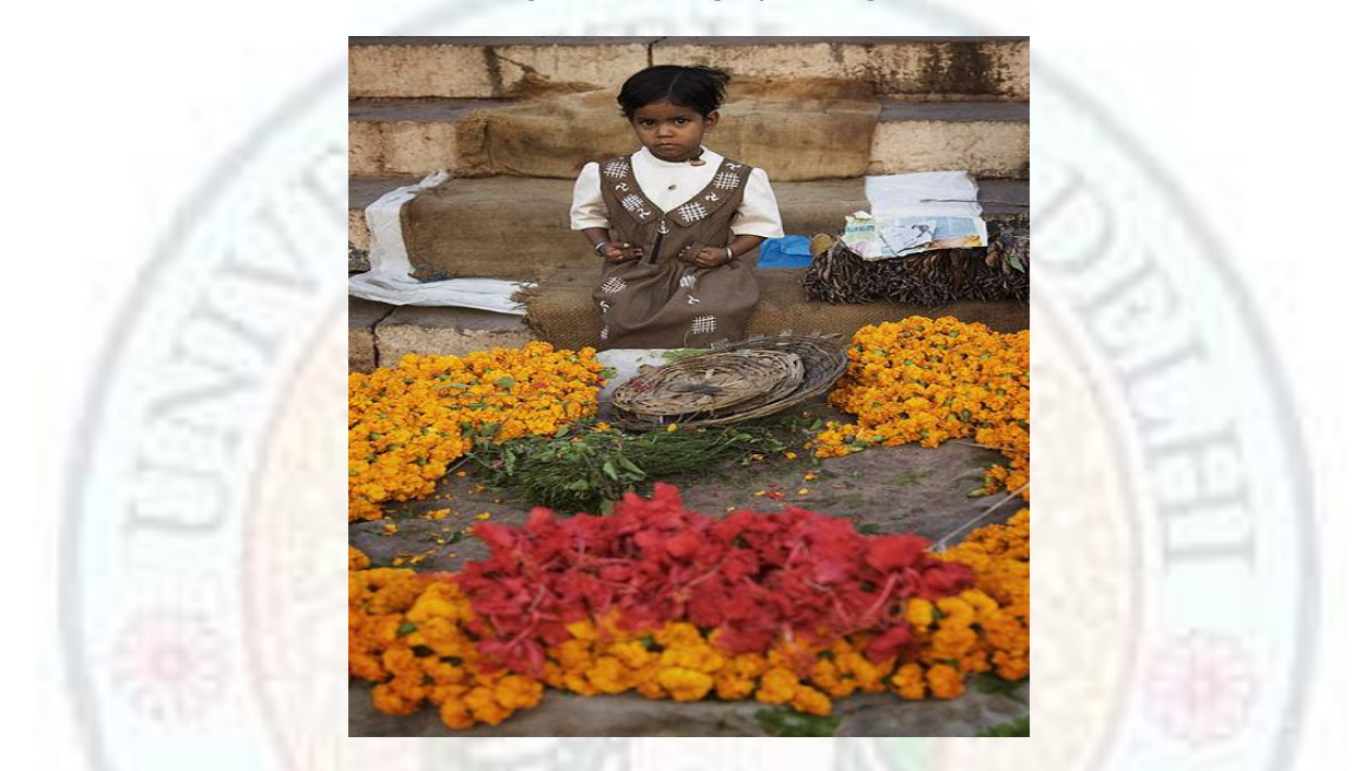
Figure 1: Living by Selling

In this world, every person sells something whether it is in the form of product or service. Some sell products to earn their livelihood whereas some sell their services in exchange of money. The figure below depicts the importance of selling in the lives of people; where a young girl can be seen selling flowers at the Ghats of Varanasi, India.