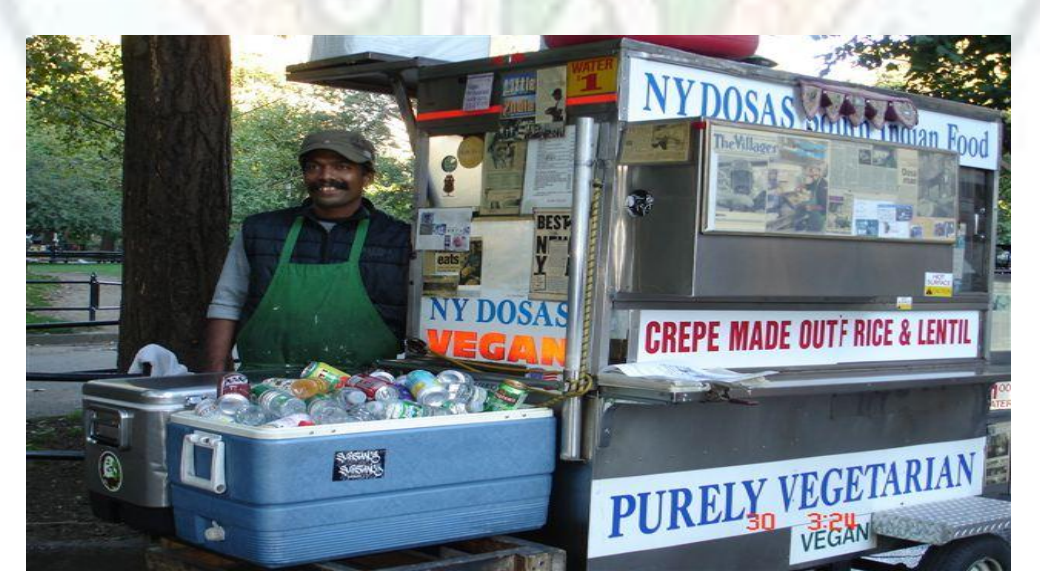
Figure 9: Creating Need of Indian Food in New York

With traditional selling concepts, selling would be a really difficult proposition. So innovation in selling techniques is crucial for the sales community. New strategies are being designed to take the unwanted pressure off the clients. Instead of manipulating the prospect and coaxing them to buy, the sales representative are taught to understand the customers' psyche. It is very important for the company to know the problem of the customer. Engaging the customer in the sales process is the new way out. Helping the customers realize their needs and letting them recognize the importance of a product/service smoothes the process of selling. The companies through their sales representative share the market information with the client and assist them in making their own decisions. Consecutively, for the sales personnel to achieve this level of efficacy; a good perceptive knowledge of the human behaviour and its decision making capabilities is crucial. In the figure 10, the seller in New York is trying to make Indian people realize their need of Indian vegetarian food by mentioning "South Indian Food" and "Purely Vegetarian" on his stall. Here, the seller is trying to understand the targeted customer's psyche and is acting accordingly.